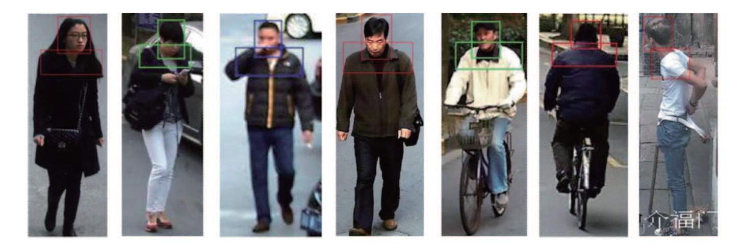
Fig. 3. The upper-body regions of different pedestrians. In our dataset, there are male and female, pedestrians and cyclists, taken from front, back and sides.