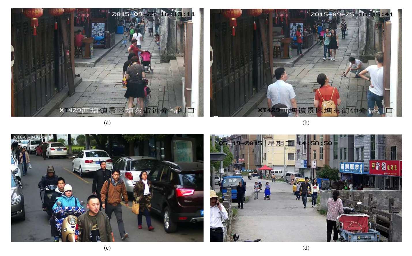
Fig. 1. Examples for ambiguous pedestrians. (a) Sitting people. (b) Squatting people. (c) People taking motorcycle. (d) People using handcart.

pictures. As a result, these datasets are not suitable to detect the upper-body instance as a substitute for pedestrian detection. For applications in ADAS or surveillance, the scenes need to be on the road, with low image resolution and high viewpoint. In surveillance videos, the crowd may cause occlusion. At the same time, these datasets are very small. BBC TV Signing dataset contains 300 video clips and each one of them is only 1-3 seconds. VGG Upper Body Dataset has 290 images. These datasets are too small to train deep learning models. Some researchers use INRIA Person Dataset [11] to train upperbody detectors. But as INRIA Person Dataset only contains annotated pedestrians, researchers have to refine the annotations by themselves, which means a lot of extra work. So the existing datasets are not enough for upper-body detection.