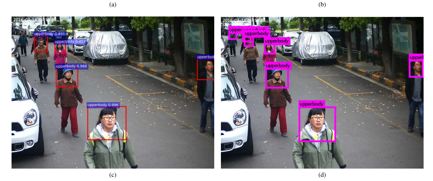
Fig. 4. The detection result of different methods. (a) ACF Detector, (b) Faster R-CNN, (c) SSD, (d) YOLOv2.

union yields the final score. When the predict position is more accurate, the overlap area and union area are closer, and the IoU is closer to 1. A threshhold is used to calculate the AP of our detector. If the IoU of a predicted bounding box is bigger than the threshhold, it is accurate and average precision is calculated. The detection position accuracy can be seen through the change of average precisions under different threshholds. If the average precisions change a lot, the position accuracy of the detector is bad. In our experiments, the latest version of Dollars Computer Vision MATLAB Toolbox [19] is used to train aggregate channel features (ACF) [11] upper-body detector and compared with other DCNN-based detection methods. The negative samples are extracted from the background of each image randomly. The model's size is changed from 100 \times 41 to 36 \times 45 , because of the shape of upper-body region.